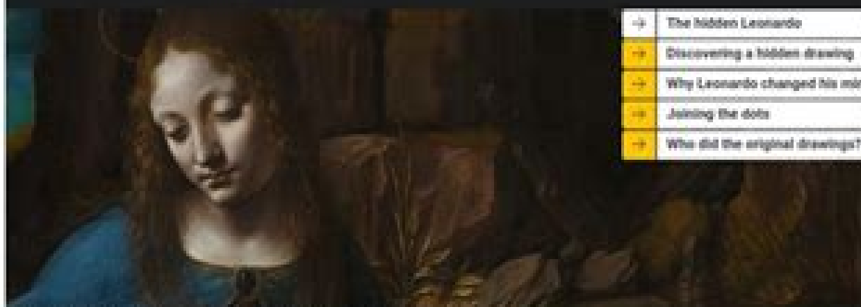
Leonardo da Vinci, 'The Virgin of the Rocks', about 1491/2-5 and 1506-8

Uncover the hidden painting behind one of the most celebrated masterpieces at the Gallery, Leonardo's 'The Virgin of the Rocks'.