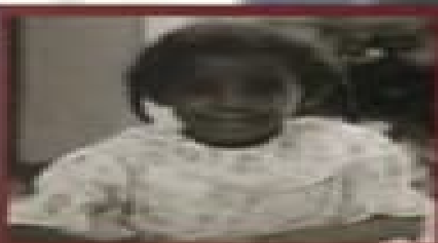
CHRISTOPHER PAUL CURTIS