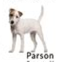
Parson Russell Terrier