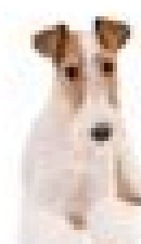
Wire Fox Terrier