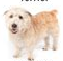
Glen of Imaal Terrier