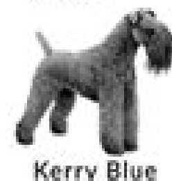
Kerry Blue Terrier