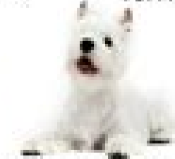
West Highland White Terrier