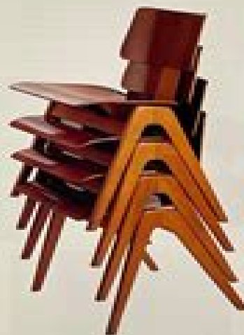
Chair, 1951 Designed by Eileen Gray and J. J. P. Oud The chairs were designed for the Festival of Britain and were made of dark wood. They have a simple, functional design and are stacked on top of each other.

The festival was a triumph. It was a celebration of the nation's recovery and a showcase for the new Britain. The festival was held in the heart of London, at the Royal Albert Hall, and it was a triumph. It was a celebration of the nation's recovery and a showcase for the new Britain. The festival was held in the heart of London, at the Royal Albert Hall, and it was a triumph.