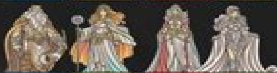
STRIBOG LADA ZORYA MOKOSH