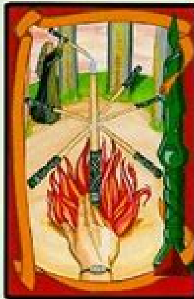
Seven of Time