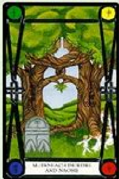
5- The Beloved