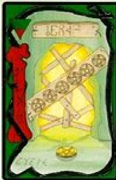
Seven of Domhan