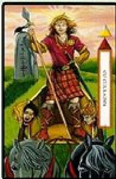
Ruler of Time