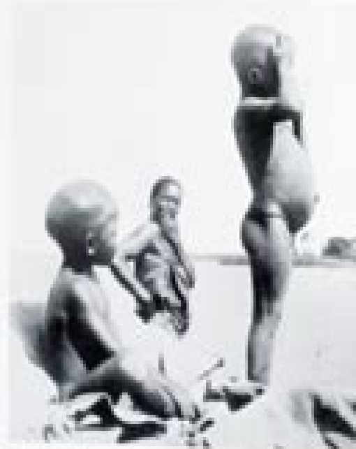
At the beach, 1931. L. and R. are the same person.