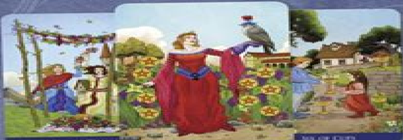
FIVE OF WANDS