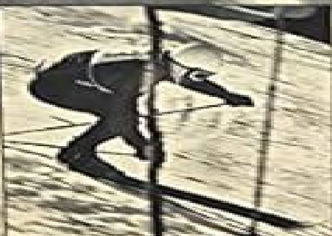
SLALOM and GANT SLALOM

Head Coach, 1964 United States Olympic Skiing Team