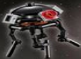
IMPERIAL PROBE DROID