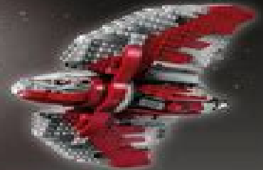
T-6 JEDI SHUTTLE