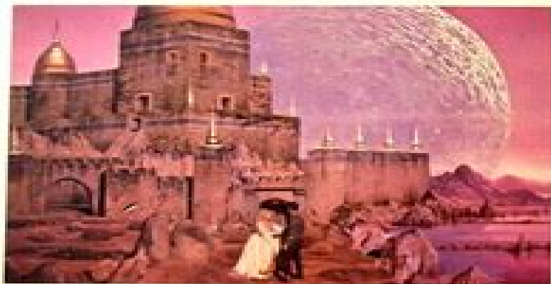
THE VULCAN FORTRESS