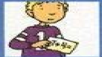
MATH FACTS AND MEASUREMENT