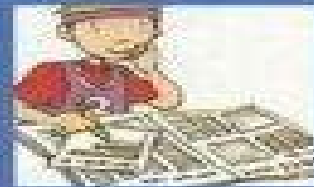
COMPREHENSION AND CRITICAL THINKING