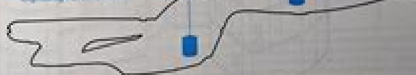
4.1.1 Location of main computer cores