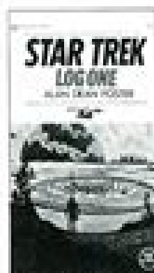
Star Trek, another fantastically successful series from Paramount Television.