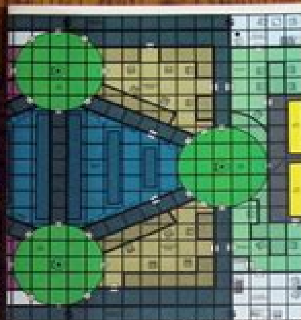
STANDARD BRIDGE AREA MAP