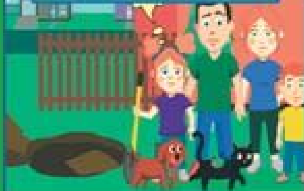
Planting the Christmas Tree