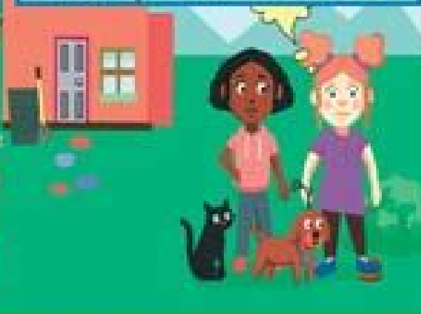
Ruby's New Shoe