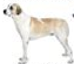
Anatolian Shepherd Dog