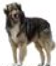
Carpathian Shepherd Dog