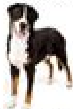
Greater Swiss Mountain Dog