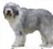
Romanian Mioritic Shepherd Dog