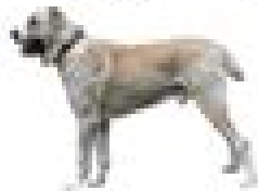
Central Asian Shepherd Dog