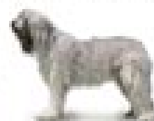
South Russian Ovcharka