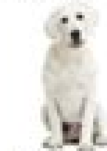
Polish Tatra Sheepdog