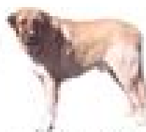
Rafeiro do Alentejo