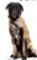
Estrela Mountain dog