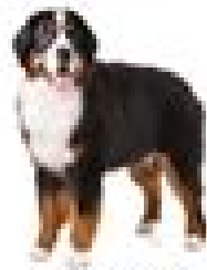
Bernese Mountain Dog