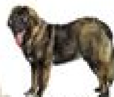
Caucasian Shepherd Dog