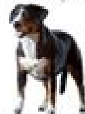
Entlebucher Mountain Dog