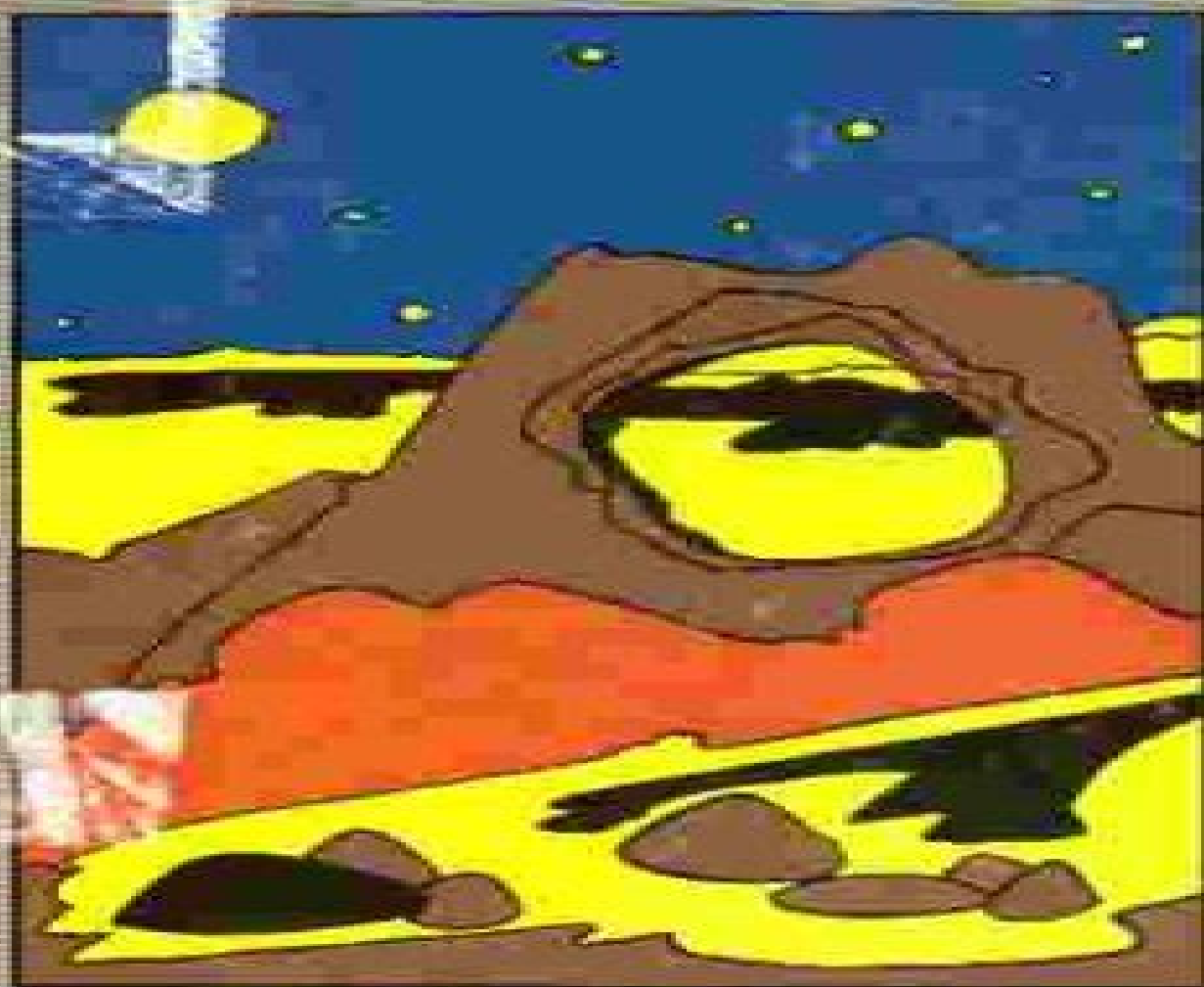
Illustration by [illegible]