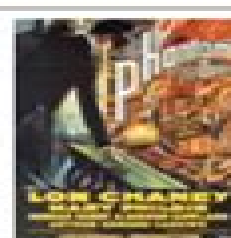
The Phantom of the Opera 1929

43005-8 Noble—Color Your Own Great Flower Paintings $3.95