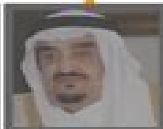
KING FAHD ruled 1982–2005