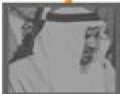
KING KHALED ruled 1975–82