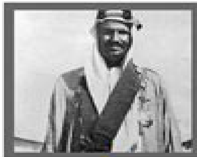
KING ABDULAZIZ AL-SAUD ruled 1932–1953

The Saudi monarchy's recent shake-up of its succession plan catapults a younger generation of royals into leadership roles at a time when the country is attempting to assert regional political and military leadership and reshape its ties with Western allies.