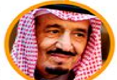
KING SALMAN rule-2015-