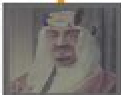
KING FAISAL ruled 1964–75