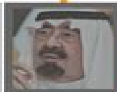
KING ABDULLAH ruled 2005–2015