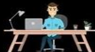
IMPLEMENTING WHAT YOU LEARN