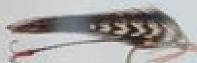
left Black Knight Marching Lure