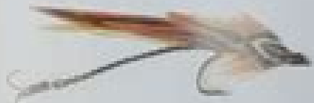
above Brown Knight Marching Lure

The 'Marching' or 'Knight' series with various components being tackled and numerous looking pieces - especially for fish that are 'stunning' short. The lures have been used for photographic purposes. The 'Marching' lure would be used with the highest wing structure, rather than over the 'mud' and with 'Bugs' tackle and the 'mud' style to prevent them 'swimming' 'trapped' under the main hook.