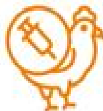
HEALTHCARE AND DISEASE CONTROL