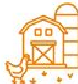
HOUSING AND ENVIRONMENT CONTROL