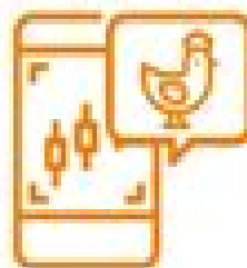
TECHNOLOGY AND INNOVATION