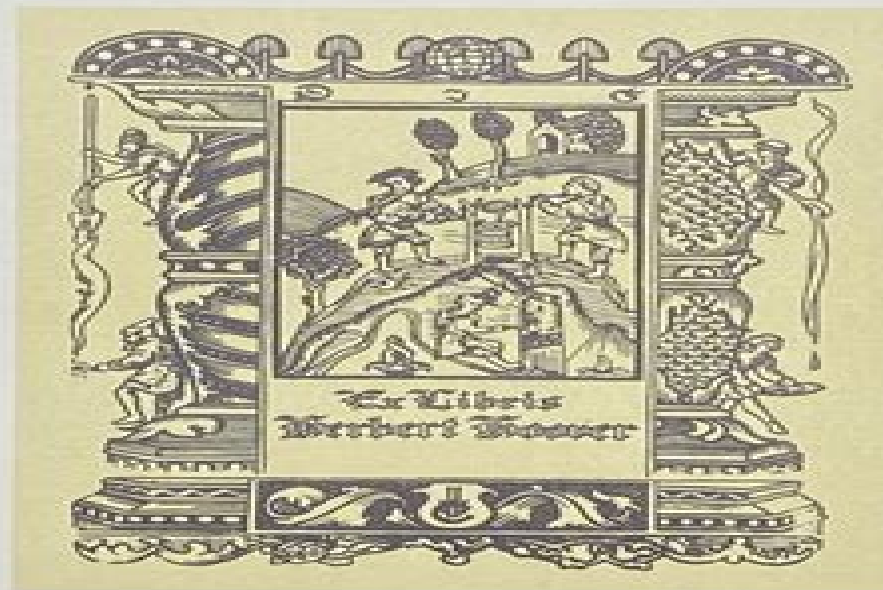
Herbert Hoover's Bookplate.