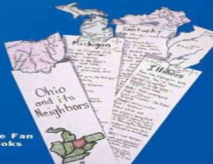
State Fan Books