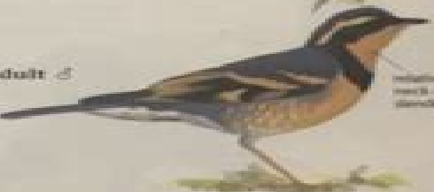
relatively long neck and slender head

Voice: Song a single, long whistle on one pitch one and a half seconds long and repeated about every ten seconds; each whistle on a different pitch; some notes trilled or buzzy. Call a short, low, dry chirp very similar to Hermit Thrush but harder; also a hard, high chirp and a soft, short flap. Flight call a short, humming whistle.