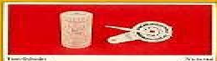
Simple Vertical Sundial