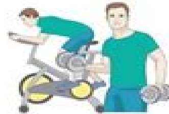
Consistent Exercise Weights + Cardio