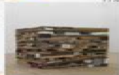
Tony Cragg, Stack, 1976