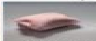
Knotted 'whirlwind' United One, Tinsell, 1975