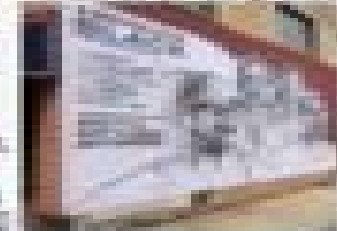
Takumi Chino, Glorious City, 2004