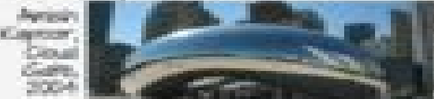
Archi Kapoor, Cloud Gate, 2004