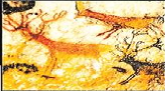
Graffiti - the curse of the modern age.

Tenants of the Lascaux caves in the Dordogne are hopping mad. They've been given two weeks to get out of their homes, all on ac-