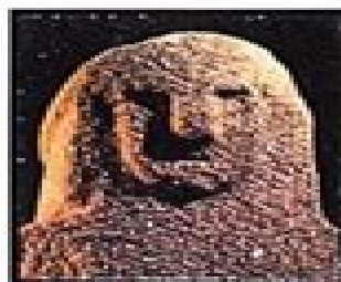
Zog. Burned again.

Insurance companies blame the Society of Firemakers. "They go out with long sticks looking for fire whenever they can find it," said a spokesman. Bush fires, lightning strikes, volcanoes, anything that's hot. Then they put their