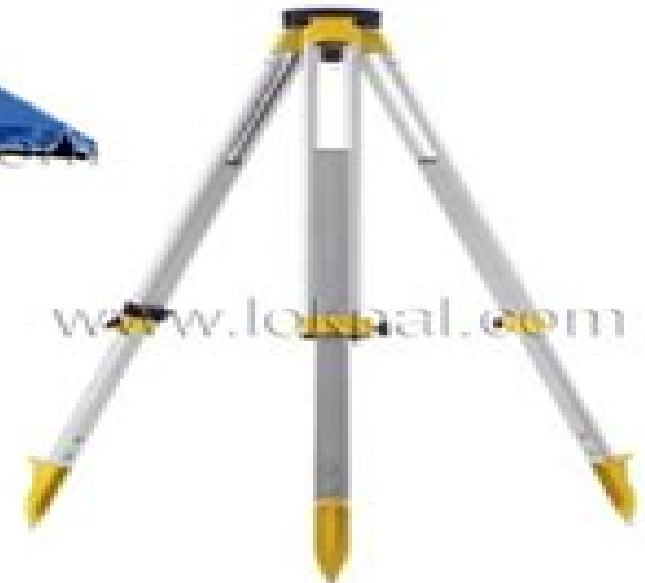
Tripod for Survey Instruments