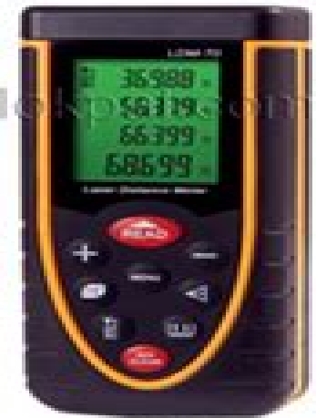
Laser Distance Meter