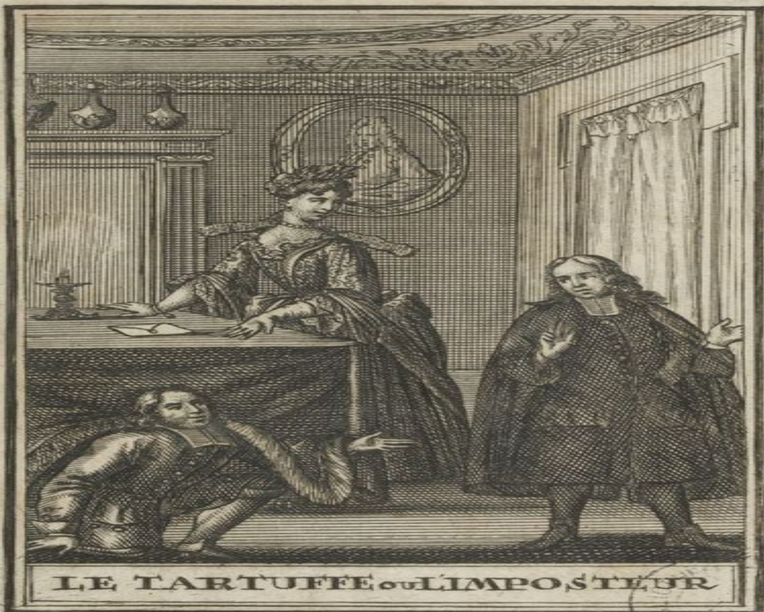
LE TARTUFFE ou L'IMPOSTEUR