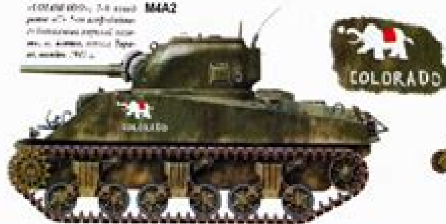
10-100,000 copies; 2-3 copies per cell. 3 H-methylthioadenosine triphosphate incorporation for transcriptional regulation requires an internal promoter. Replication requires 100% 3 H.