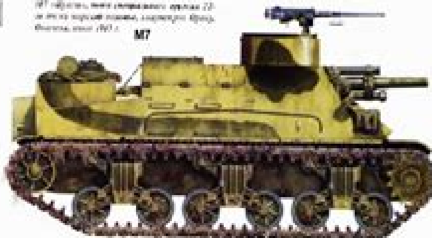
1977) and, more importantly, studies (e.g. de Wit 1980) have shown that, in general, the effects of temperature on the growth of plants are not linear. In fact, the relationship between temperature and growth rate is often sigmoidal, with growth rate increasing rapidly with temperature up to a certain point, after which it levels off or even decreases. This non-linear relationship is important to consider when interpreting the results of the present study, as it suggests that the effects of temperature on growth rate may be more complex than a simple linear relationship.