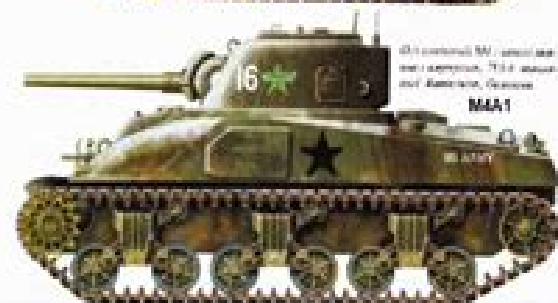
© 2000 Blackwell Science Ltd, Journal of Internal Medicine 247: 395–401