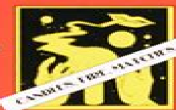
CANDLE FLAME STAGE