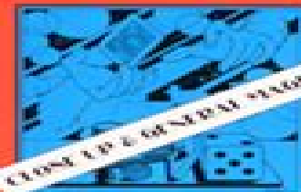
CLOSE UP & GENERAL STAGE

15 Chapters with hundreds of illustrations, designed to delight all who love performing, watching or learning Magic.