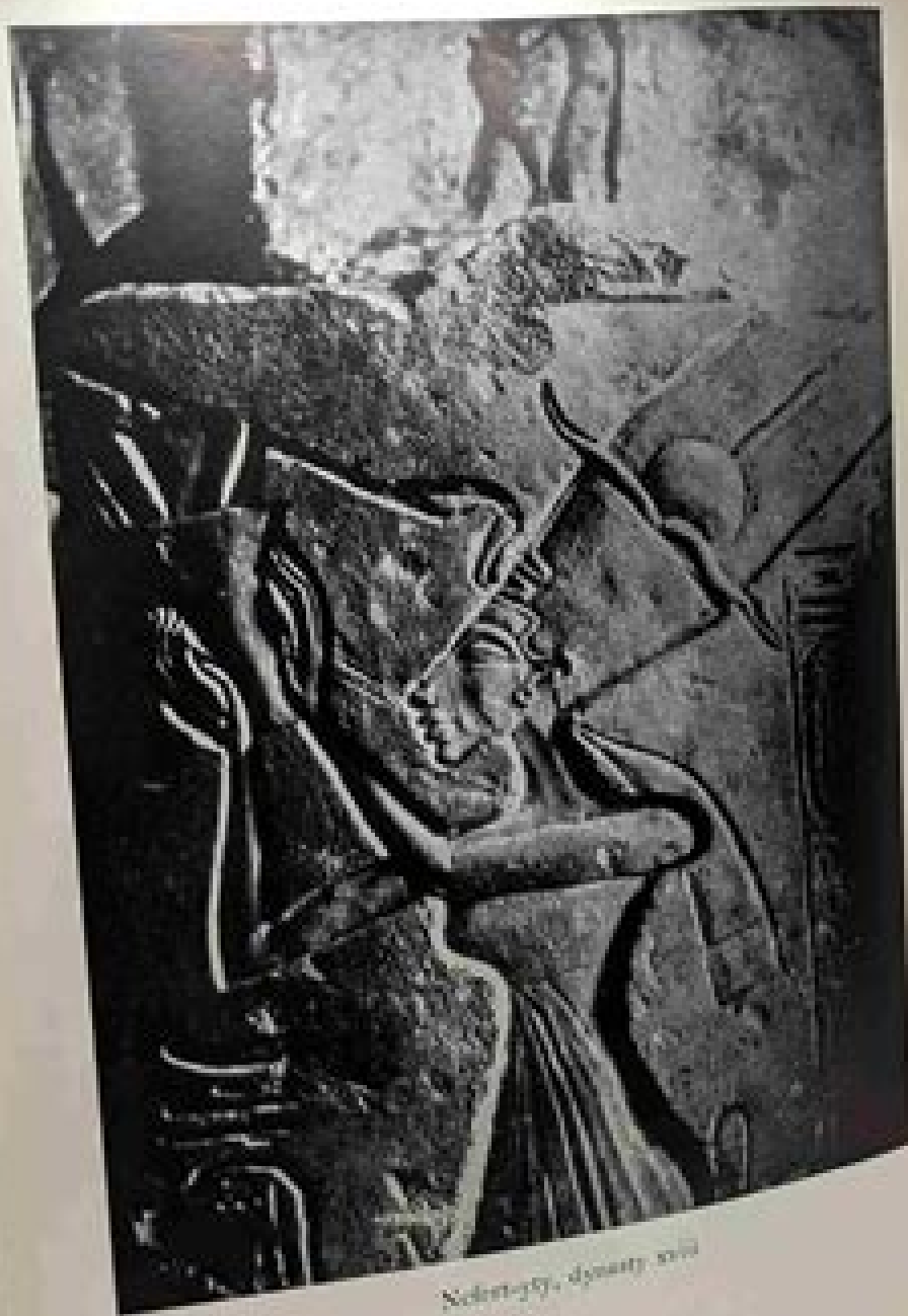
Soteris, dynasty xviii