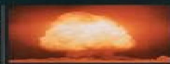
SCIENCE, THREATS & TRAITORS