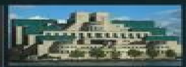
21ST CENTURY INTELLIGENCE