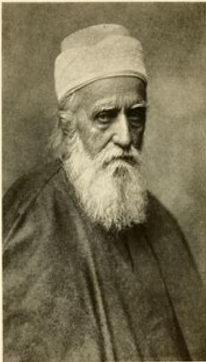
AMRU BABA The Servant of God