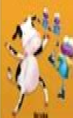
Illustration by [unintelligible]