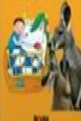
Illustration by [unintelligible]