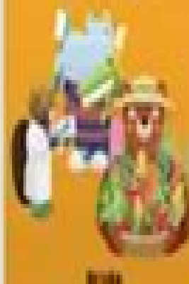
Illustration by [unintelligible]