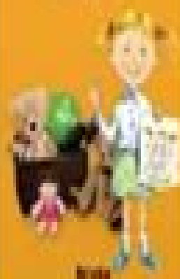
Illustration by [unintelligible]