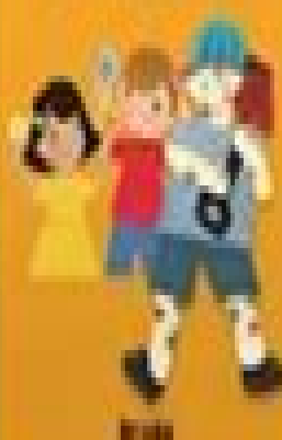
Illustration by [unintelligible]