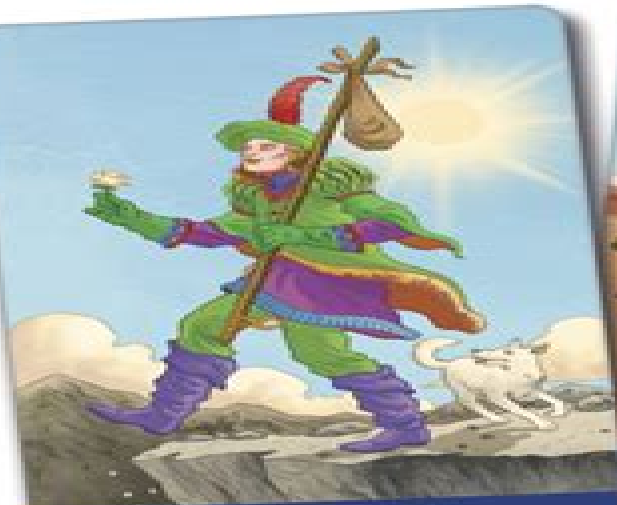
0 • THE FOOL