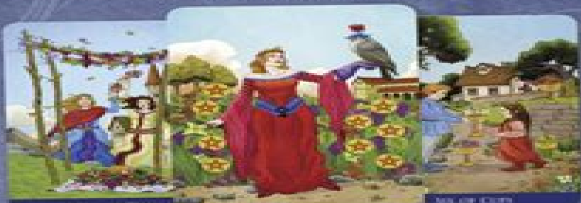
FOUR OF WANDS