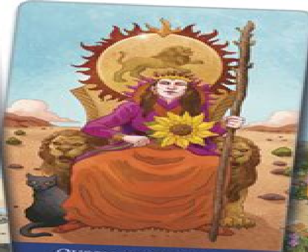
QUEEN OF WANDS