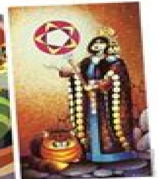
Ace of Pentacles