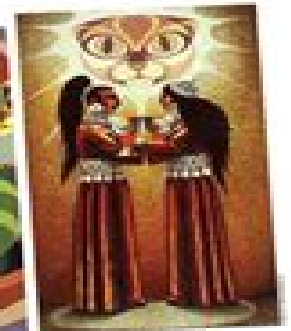
Two of Cups