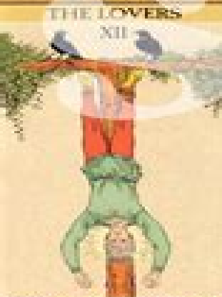
THE HANGED MAN