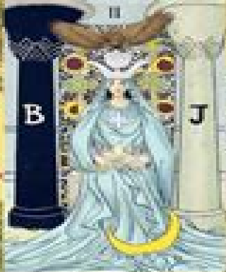
THE HIGH PRIESTESS