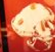
23. VANILLA A swirl of vanilla ice cream on a wafer, topped with a cherry.