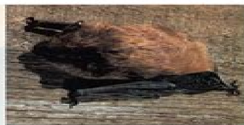
THE BIG BROWN bat is found throughout the United States and Canada.

We should note that while experts can't say if bats are more prone to carry rabies