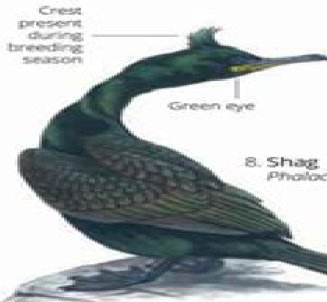
8. Shag Phalacrocorax aristotelis