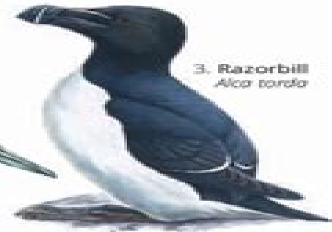
3. Razorbill Alca torda