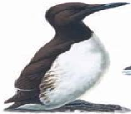
4. Guillemot Uria aalge