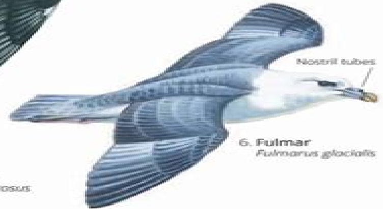
6. Fulmar Fulmarus glacialis