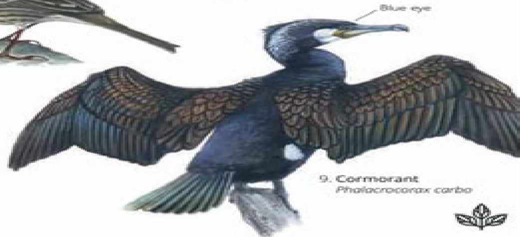
9. Cormorant Phalacrocorax carbo