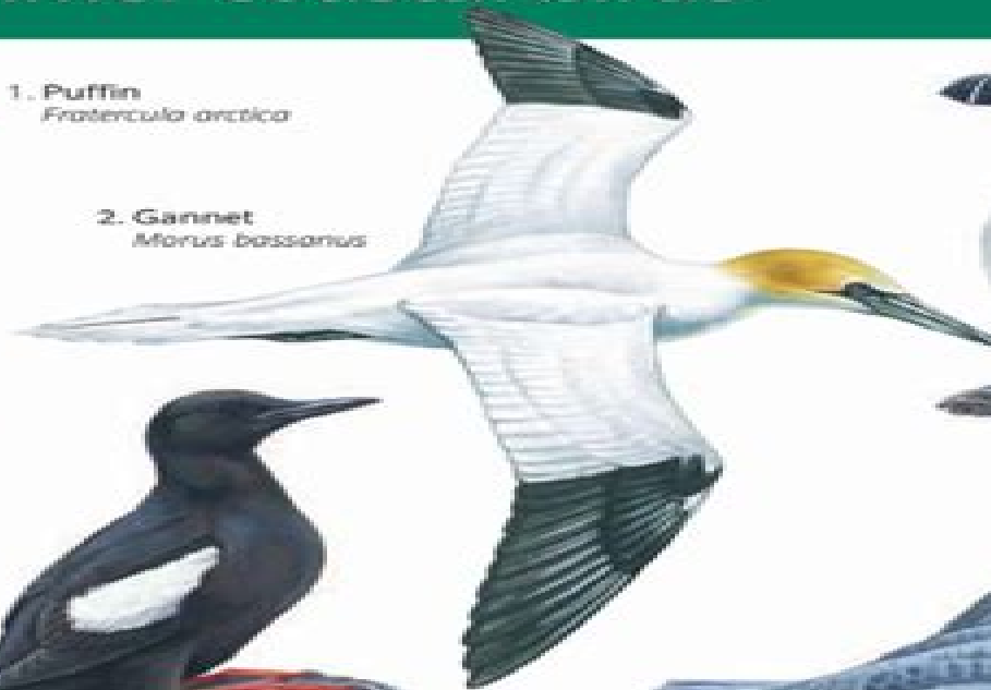
2. Gannet Morus bassarius