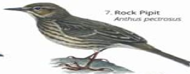
7. Rock Pipit Anthus pectrorus