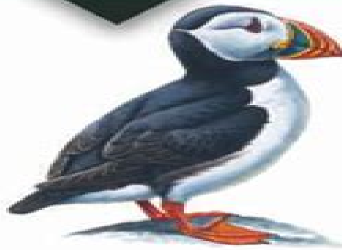
1. Puffin Fratercula arctica