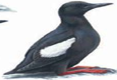
5. Black Guillemot Cepphus grylle