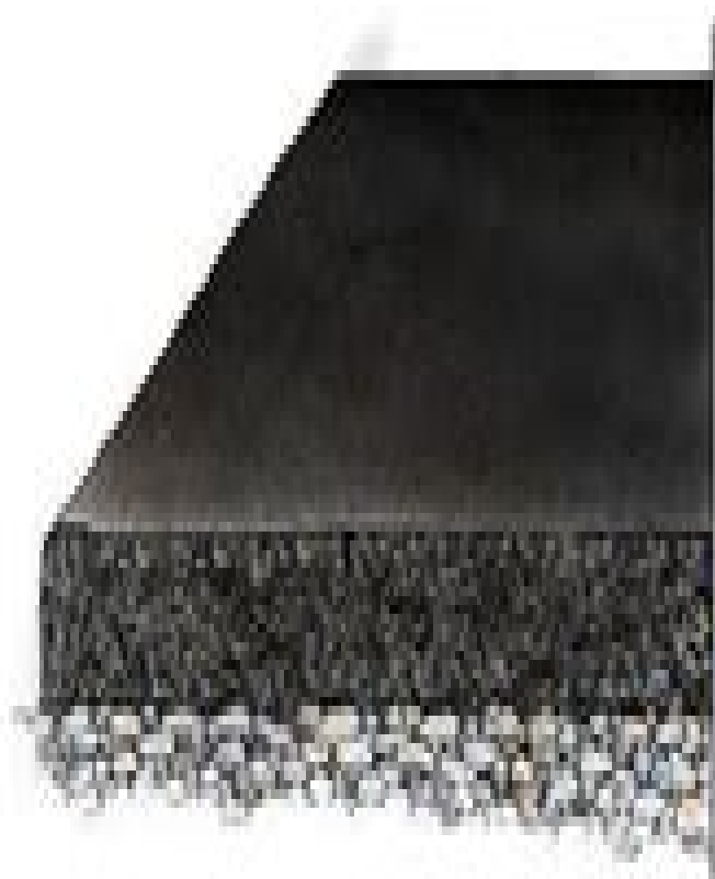
Recycled Asphalt Pavement