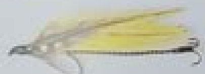
right Yellow Knight Marching Midge