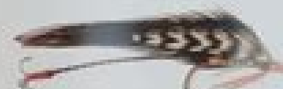
left Black Knight Marching Fly