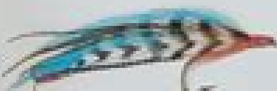
left Blue Knight Marching Fly