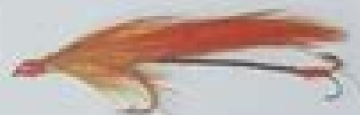
right Red Knight Marching Fly