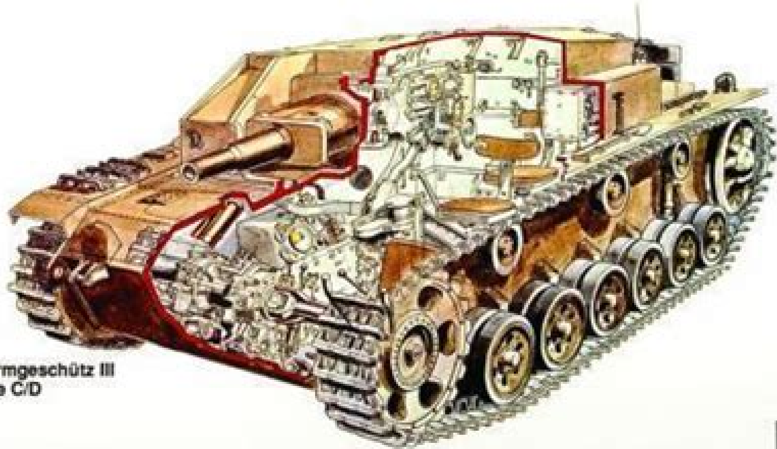
Sturmgeschütz III Type C/D