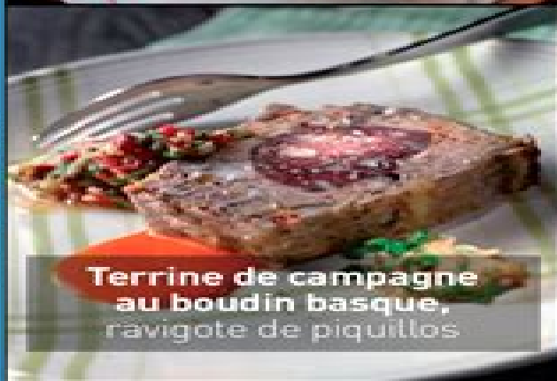
Terrine de campagne au boudin basque, ravigote de piquillos