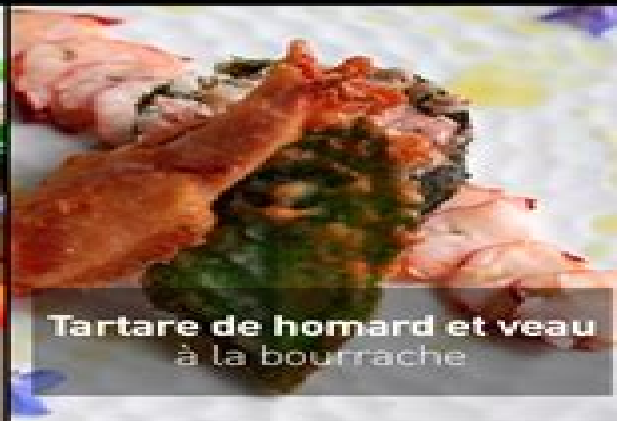
Tartare de homard et veau à la bourrache