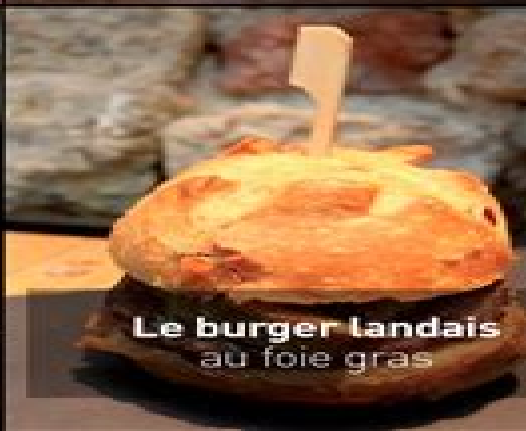
Le burger landais au foie gras