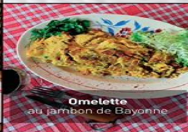
Omelette au jambon de Bayonne