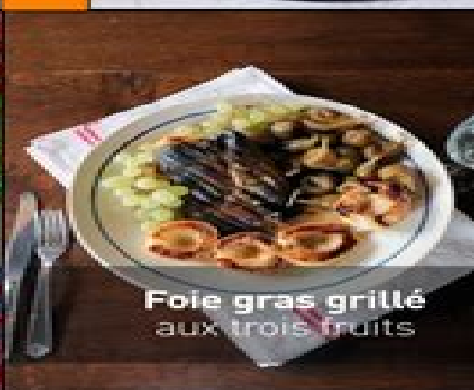
Foie gras grillé aux trois fruits