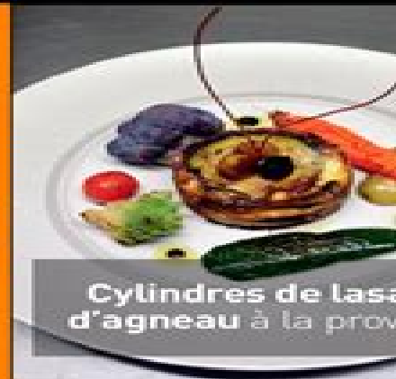
Cylindres de lasa d'agneau à la prov