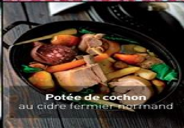
Potée de cochon au cidre fermier normand