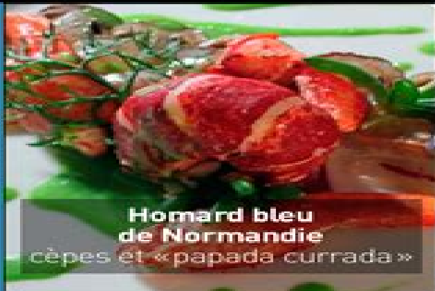
Homard bleu de Normandie cèpes et « papada currada »