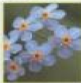
Tools and tips