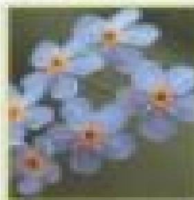
Tools and tips