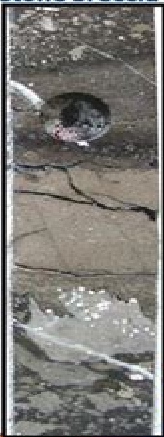
bedded boundstone breccia