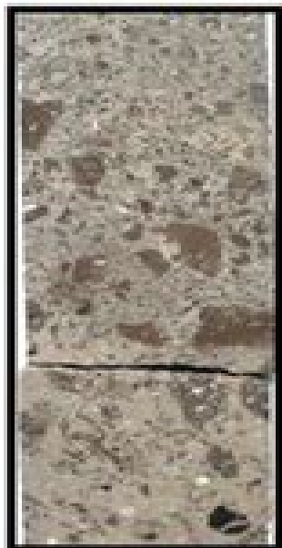
breccia with platform clasts